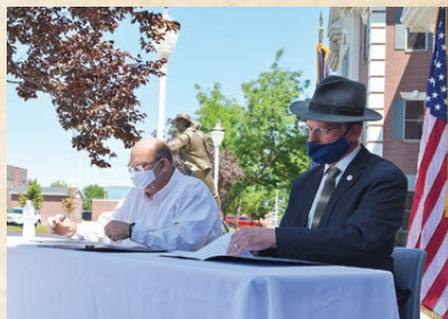
Mayor Dirk Burton City of West Jordan