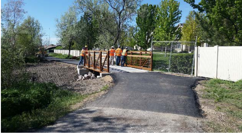
New pedestrian bridge

Project Name and Number: 7000 South Utility Project, Phase 1 SD 16-02